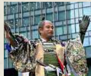
The photos are from last year's parade.

Sports teams active throughout Japan and Cultural activity groups will join together in a parade.